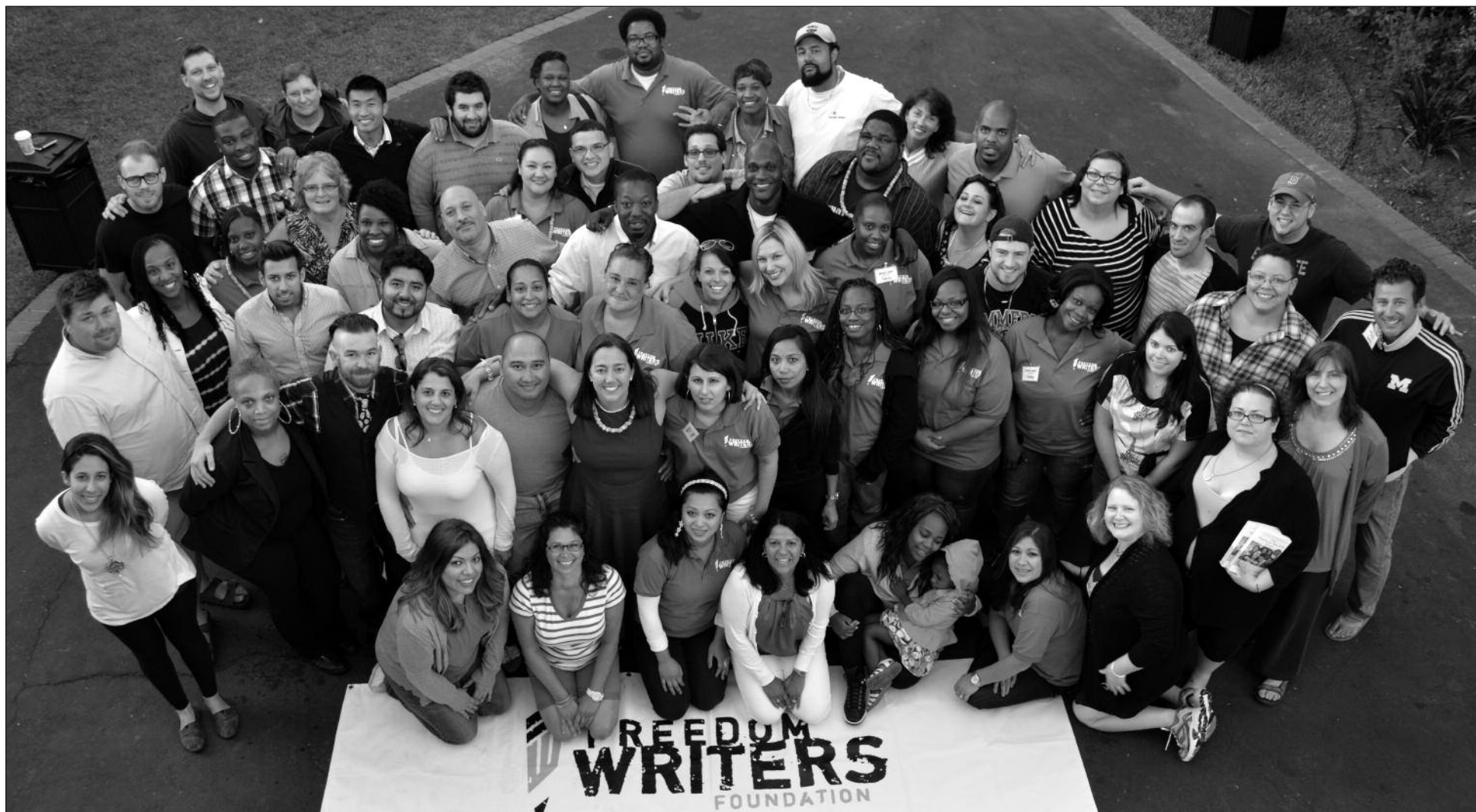
Springfield Public Schools teachers and youth supporters gather with Erin Gruwell, second row center, and some of the original Freedom Writers in California last summer.