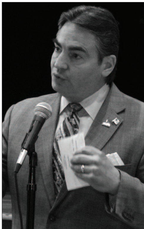
Mayor Domenic Sarno speaks at the ceremony.