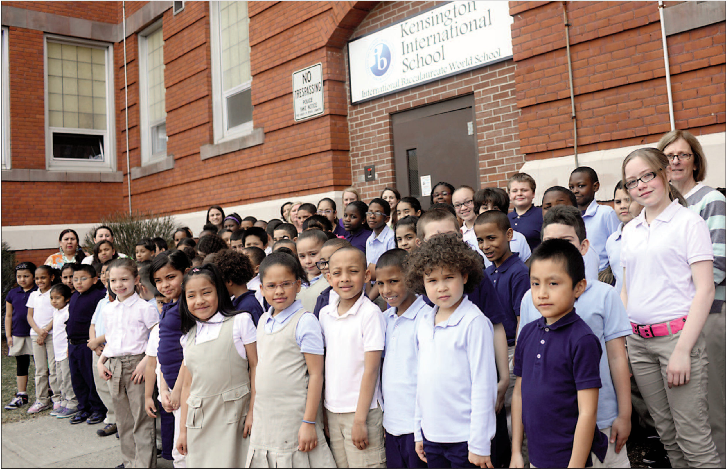
Kensington International students proudly pose in front of the school's new name.