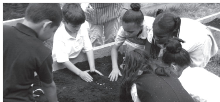
Students at Brightwood Elementary plant their school garden.