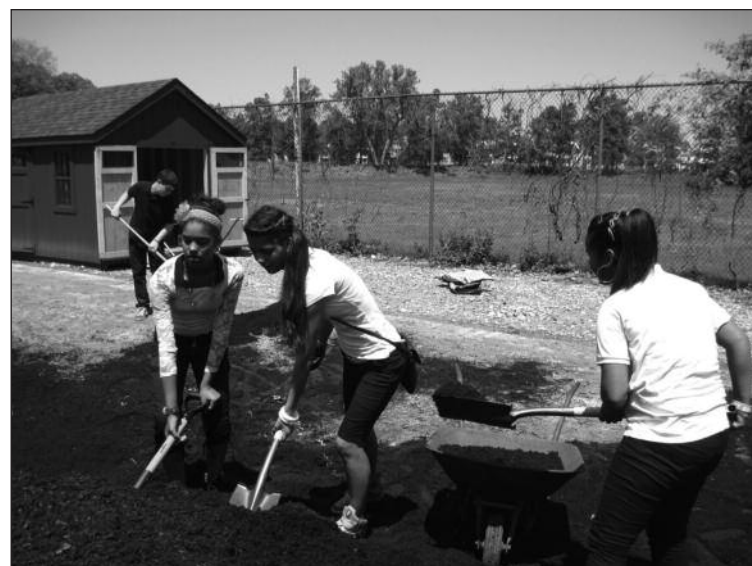
Kennedy Middle School students tend to their farm.

"Considering that 21,000 meals are served a day, an 8-percent increase is quite impressive," said Levy.