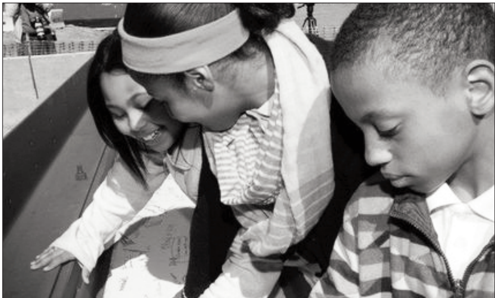
Brookings students also signed their names to the beam.