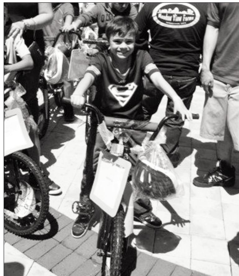
One smiling student was rewarded with a bike and helmet based on his character and commitment to education.