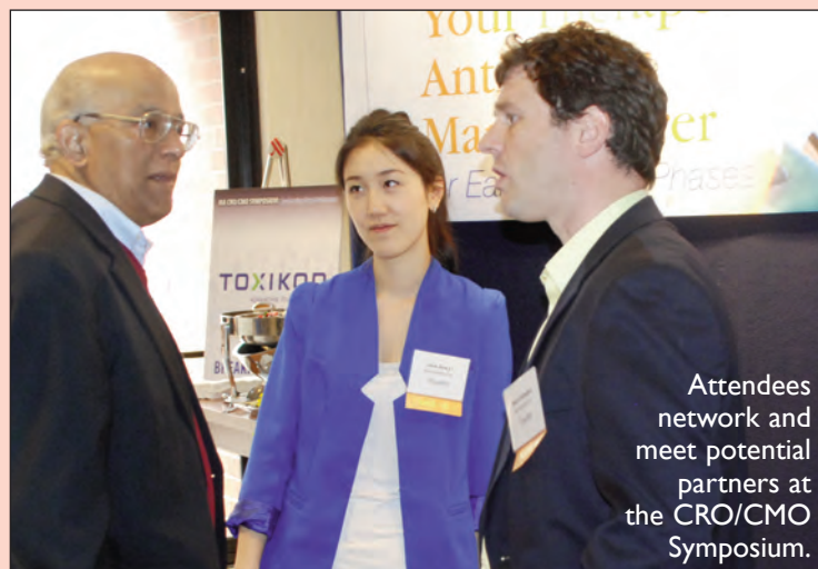
Attendees network and meet potential partners at the CRO/CMO Symposium.