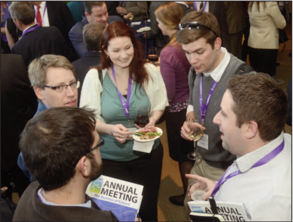
Attendees network at the reception hosted by Alexandria Real Estate.