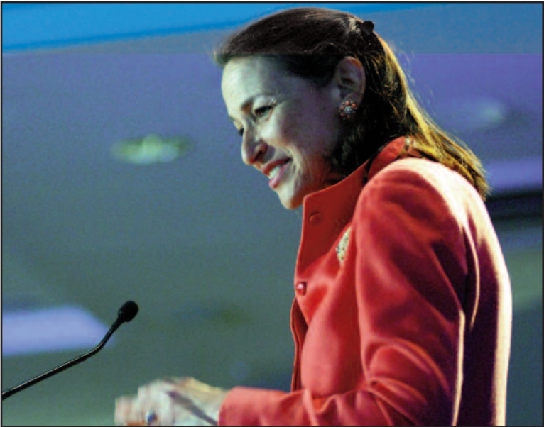
FDA Commissioner Dr. Margaret Hamburg.