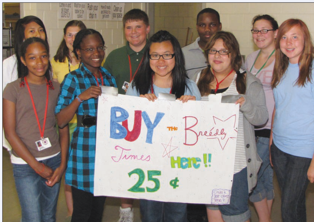
Students at Breed Middle School published their own newspaper.

Future stories for the paper will be about end-of-the-year sports and field trips, a dance, the eighth-grade roller skating