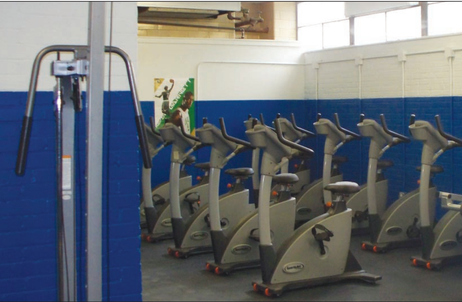
New fitness equipment at the school