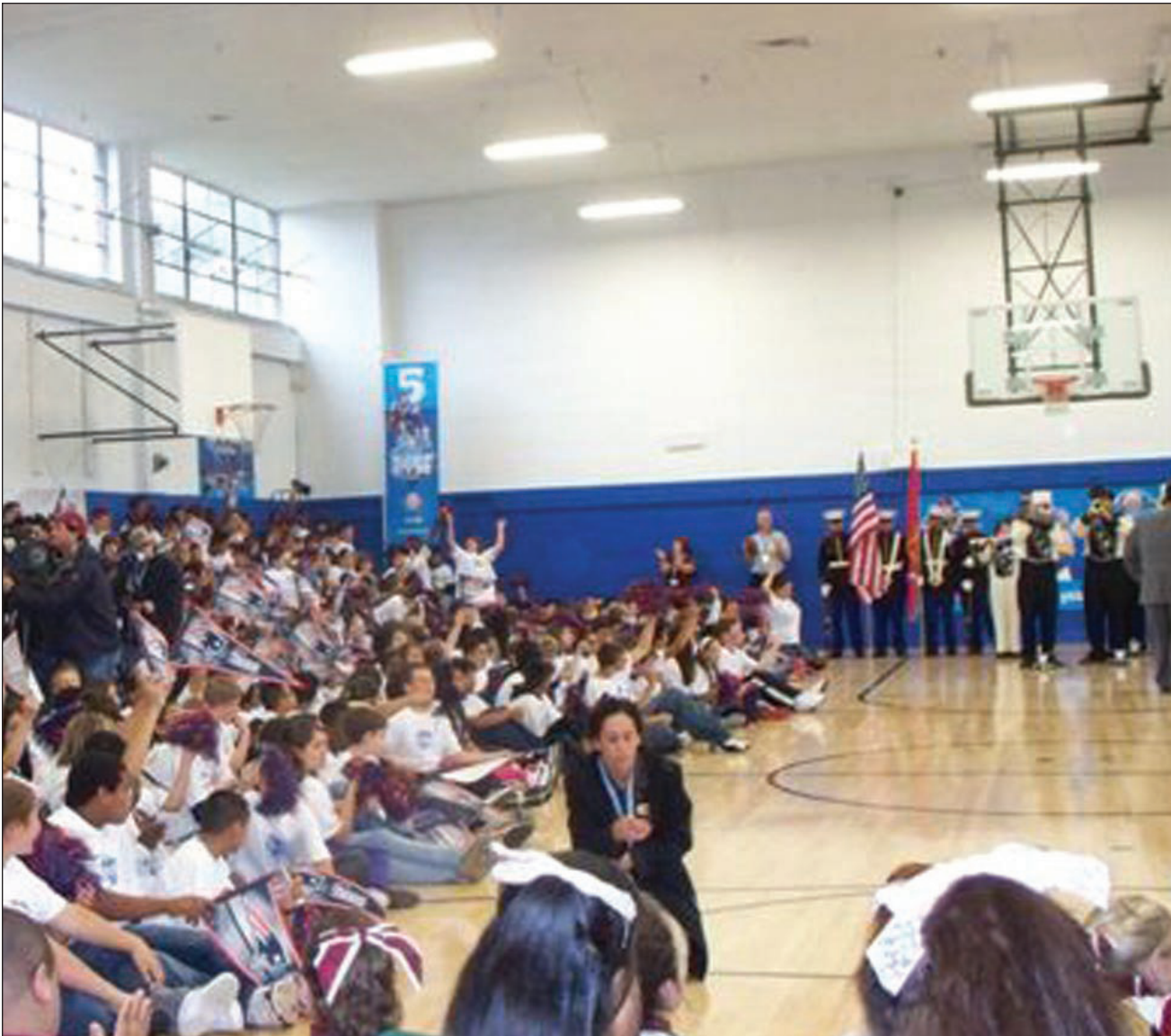
A grant from the NFL network and matched by the City allowed Pickering to renovate its gymnasium and purchase new fitness equipment.