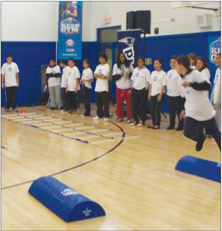
Pickering students are enjoying the refurbished gym.