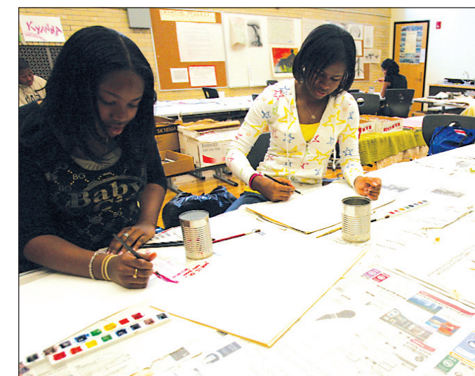
Burke students enjoy the new arts wing.