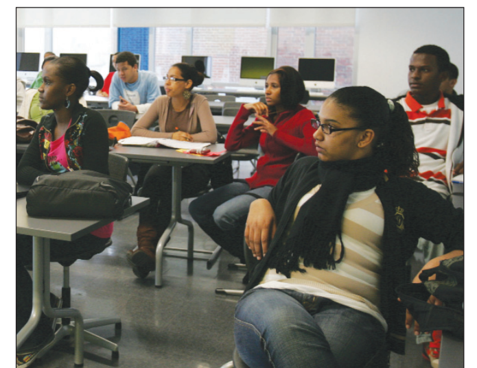
Students attend a lecture at the Burke.