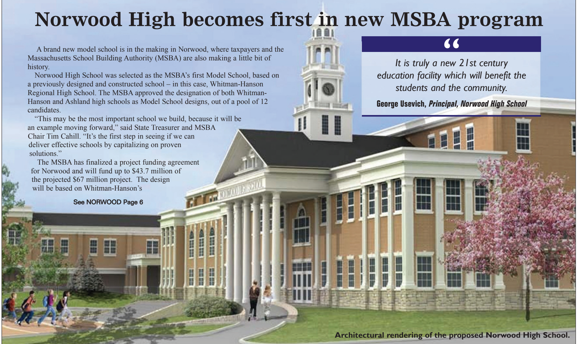
Architectural rendering of the proposed Norwood High School.