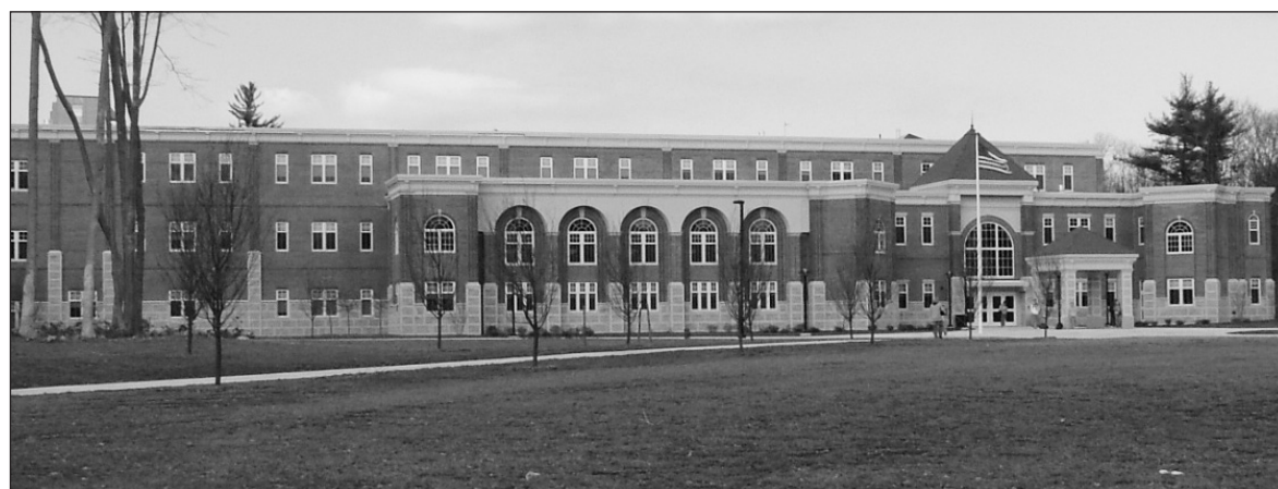
The MSBA approved the designation of Whitman-Hanson High School as one of three Model School designs.

The MSBA will work in collaboration with eligible districts to select one of the pre-qualified model schools and its designer. The designer of the selected model school will adapt the design to a suitable site within the school district and tailor the design to the required design enrollment and programmatic needs of the district. Use of Model School designs may lead to an additional five reimbursement points for a district.